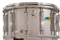
8x14" LUDWIG COLISEUM

Drumhead (batter side): Remo Weatherking Ambassador Coated