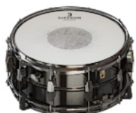
6.5x14" LUDWIG BLACK BEAUTY

Drumhead (batter side): Remo Weatherking Ambassador Coated