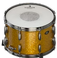
10x14" ROGERS "YORKTOWN" EAGLE BATCH (wood, '50s parade snare drum)

Drumhead (batter side): Remo Weatherking Ambassador Coated