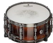
6x14" TAMA WARLORD COLLECTION MASAI BUBINGA KGB146 (wood)

Drumhead (batter side): Remo Weatherking Ambassador Coated