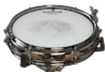
2.5x10" SONOR SELECT FORCE JUNGLE (with ten tambourin cymbals in shell)

Drumhead (batter side): Remo Weatherking Ambassador Coated