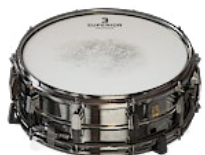
5x14" LUDWIG 400 CHROME-OVER-BRASS (COB) 1959

Drumhead (batter side): Remo Weatherking Ambassador Coated