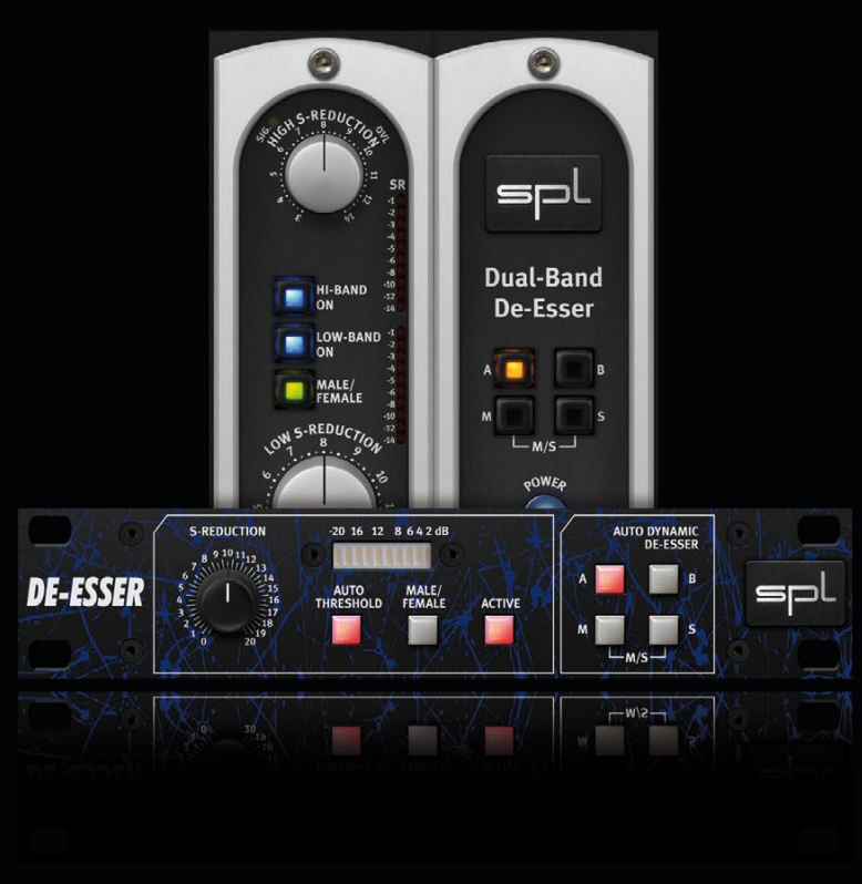
Classic & Dual-Band De-Essers