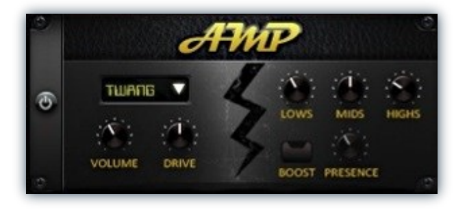
Highs - This knob controls the gain of high (treble) frequencies.

Mids - This knob controls the gain of mid-level frequencies.