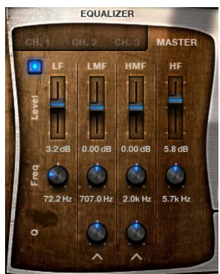
22 The Master EQ Controls

The Master EQ is accessed by clicking on the MASTER tab.