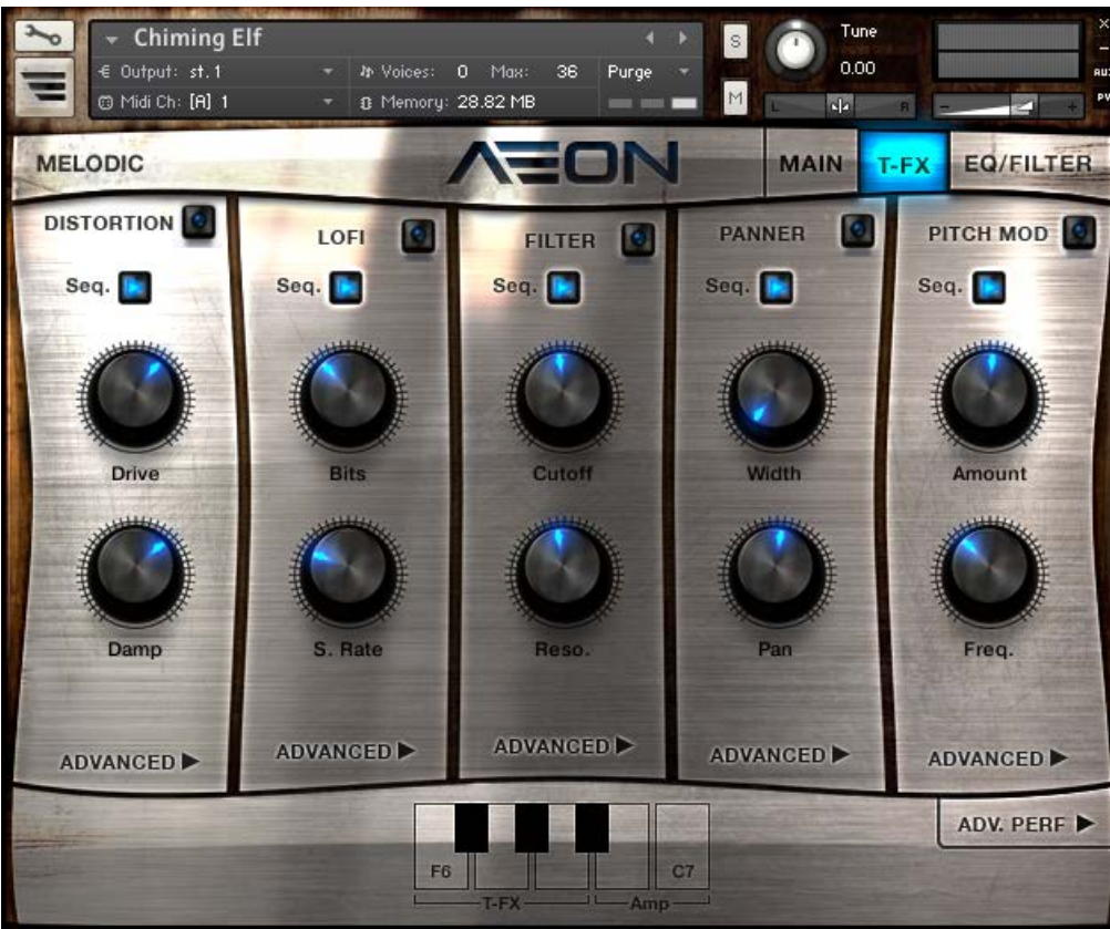
16 The Trigger FX Page

To access the Trigger FX page, click on the T-FX tab at the top of the interface.