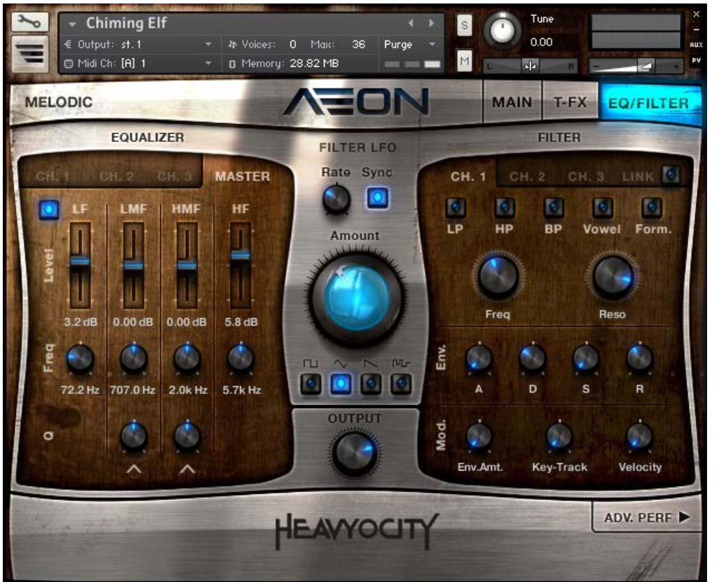
21 The EQ & Filter Page

The EQ & Filter page is where you will find controls that alter the timbre of the instrument. Each instrument contains: