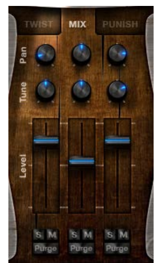
4 The Mix Controls

The Mix tab opens a 3 channel mixer for the sounds available in the instrument. These sounds will vary from instrument to instrument, but the controls will remain the same.