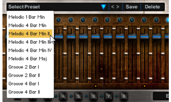
14 The Pattern Presets with the Preset Select Menu open

Since the arpeggiator included with AEON is a lot more advanced than most arpeggiators, presets are provided for you to quickly get started. You can also save up to 25 of your own presets to recall later in other AEON instruments.