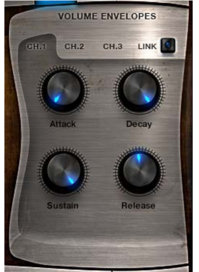
6 The Volume Envelope Section

Each of the 3 channels has its own volume envelope. The controls for a channel's volume envelope are accessed by clicking on the respective tab.