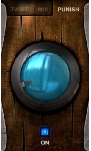
5 The Punish Knob

The Punish effect is a combination of compression and saturation controlled from a single knob. Turn the knob to punish the sound.