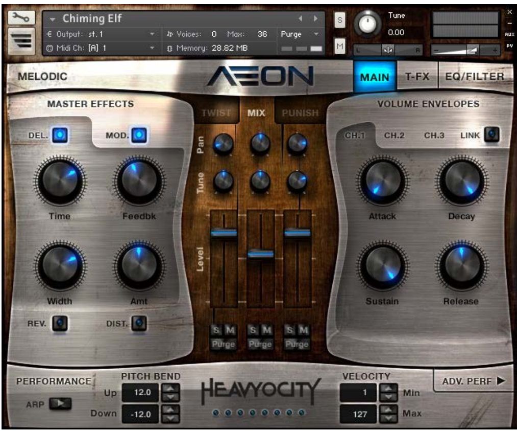
1 The AEON Melodic Interface

Every instrument in AEON Melodic shares the same interface, from which you can alter the sound or change how you play the instrument.