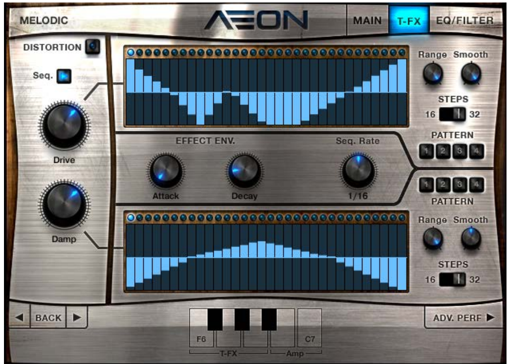
17 The Advanced Controls for the Distortion Trigger FX

The advanced page for a specific effect is accessed by clicking on the ADVANCED button at the bottom of the effect's column.