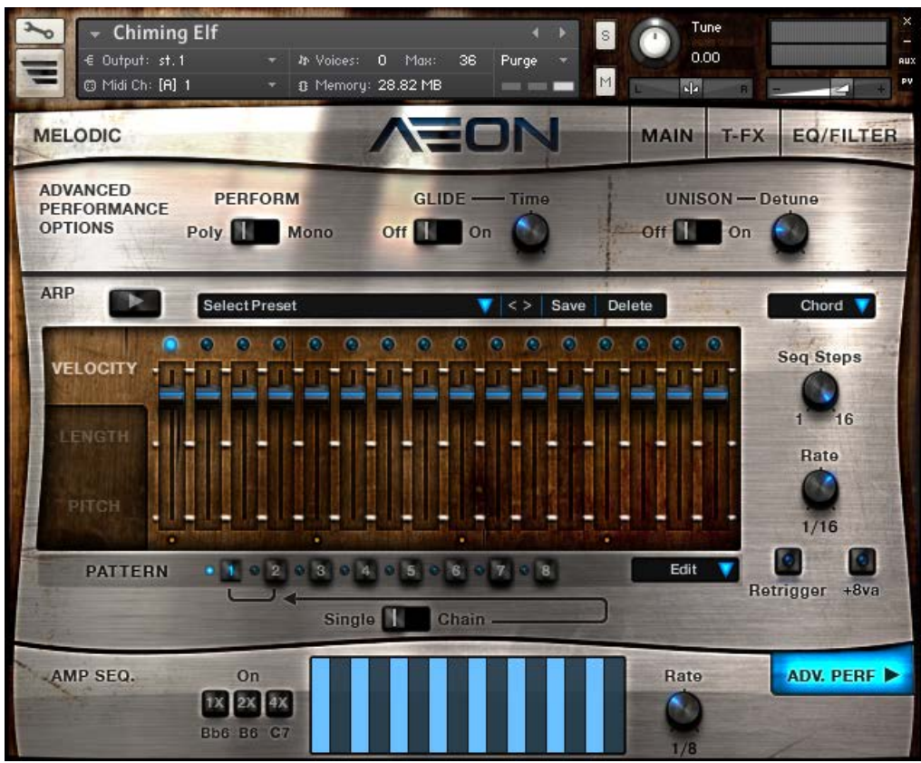
8 The Advanced Performance Options Page

This page can be accessed by clicking on the ADV. PERF button, located to the bottom right of the interface.