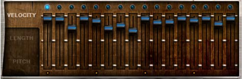
12 Arpeggiator Parameter Controls

The body of the arpeggiator section is a bank of sliders. These sliders work like a step sequencer, altering the parameter at each step according to the settings of the sliders. There are three parameters available, which are selected by using the tabs to the left: