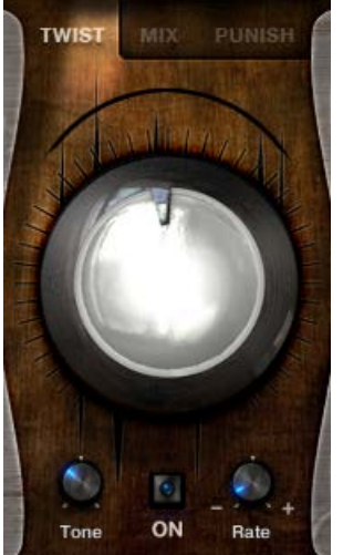
3 The Twist Controls

The twist effect is an animated, tone-altering effect that "twists" the audio. You can use it as a stationary effect to quickly alter the tone of the instrument, or you can use the animation controls to give the tone movement. The controls available are: