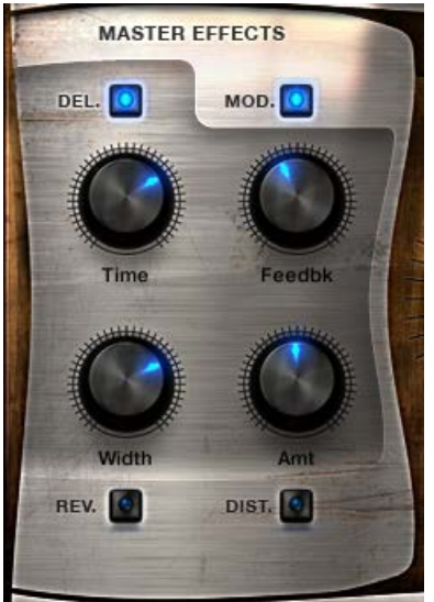
2 The Master Effects Section

Every instrument has 4 master effects, each with 4 parameter controls and an on/off switch.