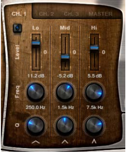
23 The Channel EQ Controls

Each channel has its own 3-band parametric EQ. To access the EQ for a channel, click on the tab with the corresponding channel number.