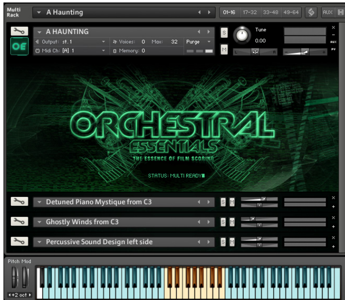
ORCHESTRAL ESSENTIALS MULTI INTERFACE

Before reading the rest of this manual, take some time to play around with Orchestral Essentials first! Get a feel for the library, the sounds and the interface. Make sure you try out the Multis. Multis are combinations of multiple instruments, stacked together to give you as many musical features on one 88-note keyboard as possible: chords, legato lines, effects and even drums. They will give you a great first impression of what Orchestral Essentials is capable of. After that, we recommend reading the rest of this manual. Having played with the library first will make it an easier and more enjoyable read!