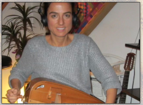
Folk Violin, Hurdy Gurdy