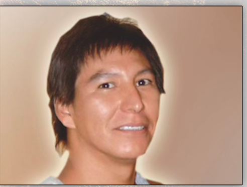
Native American Voices Solo Chants - (Lakota-Cheyenne)