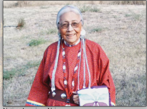
Native American Voices Grandma - (Northern Cheyenne)