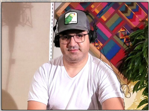
Maghreb Congas, Moroccan Darbuka, Moroccan Cajon

Member of the Afalkay Band afalkayband@gmail.com