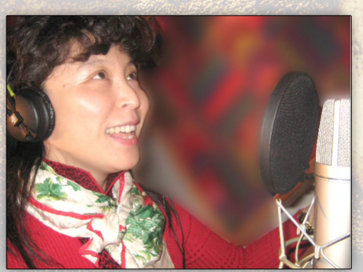
Chinese Female Voices