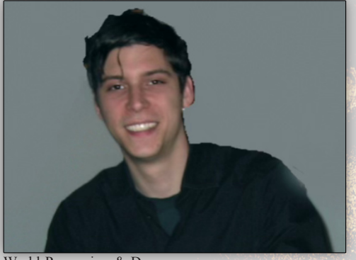
World Percussion & Drums