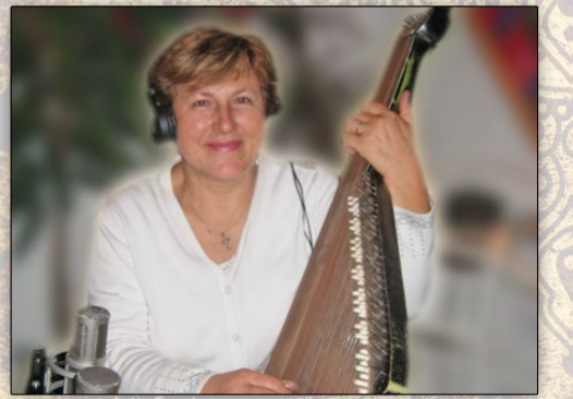
Ukrainian Traditional Songs