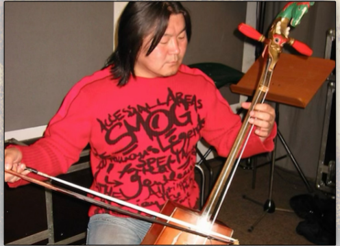
(Egschiglen Ensemble) Morin Khuur, vocals