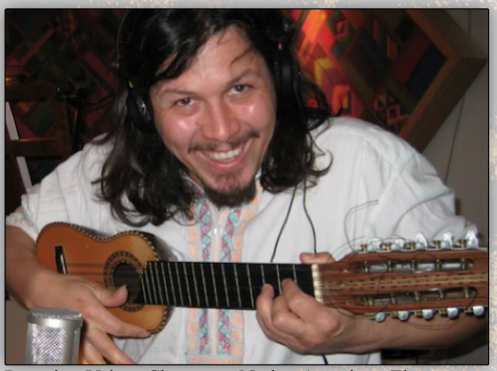
Peruvian Voices, Charango, Native American Flute https://www.youtube.com/@Yerar11Shavez