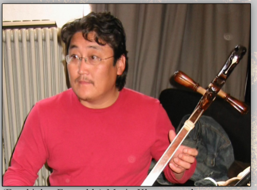
(Egschiglen Ensemble) Morin Khuur, vocals