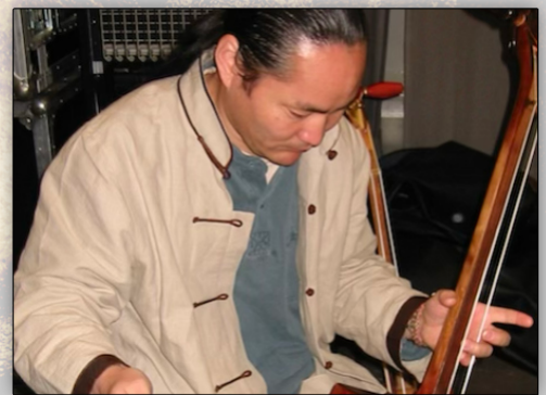
(Egschiglen Ensemble) Khoomii vocals, Morin Khuur