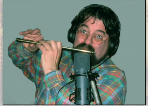
Shiva Flute, Tenor Recorder