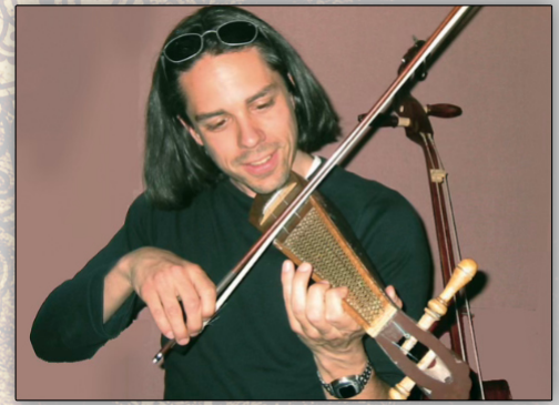
Little Moorin Khur, Egyptian violin