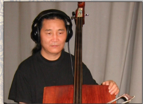
(Egschiglen Ensemble) Ih Khuur Bass